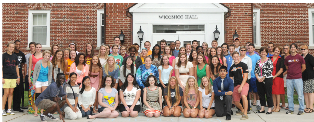
Salisbury University STEM, Biology and Nursing Living Learning Communities

Salisbury University offers extraordinary opportunities for students interested in science, technology, engineering and mathematics (STEM). The University provides engaging and rigorous STEM majors to students seeking careers in aerospace, biotechnology, bioinformatics, biomedicine, computational science, cybersecurity, environmental science, green technologies, geosciences, mechanical engineering, science and mathematics teaching, technology entrepreneurship, and many other fields. Given that graduates of STEM disciplines are critically needed to keep the United States labor force innovative and competitive, our goal is to produce highly skilled and knowledgeable STEM majors and outstanding educators for science and math teaching.