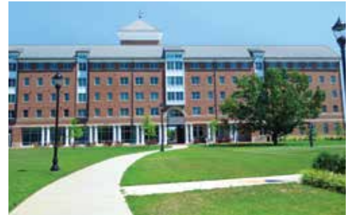
SEA GULL SQUARE