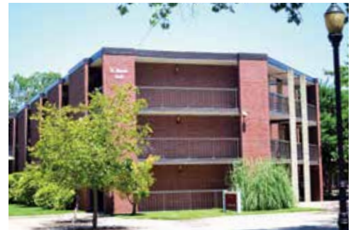
ST. MARTIN HALL