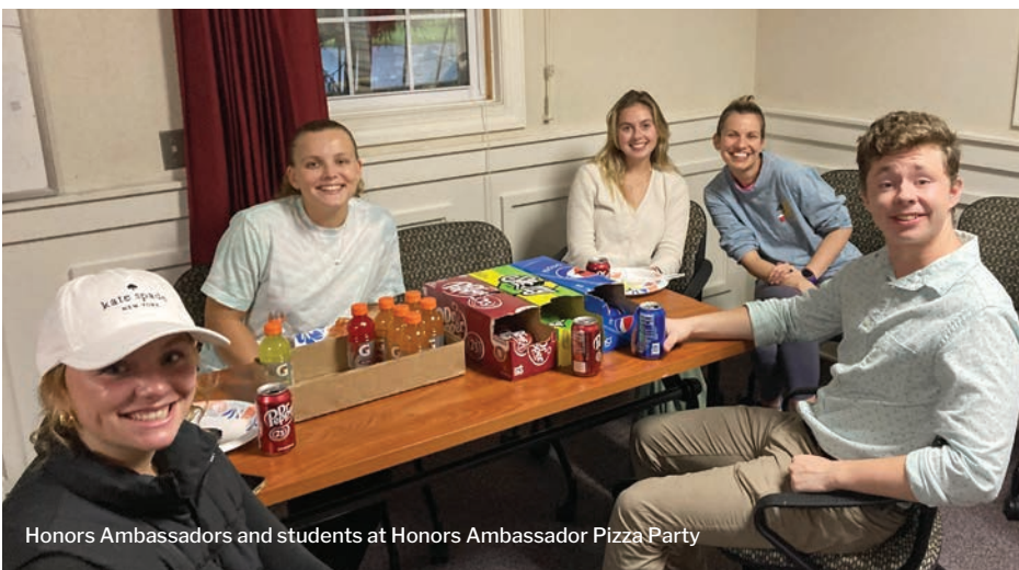
Honors Ambassadors and students at Honors Ambassador Pizza Party