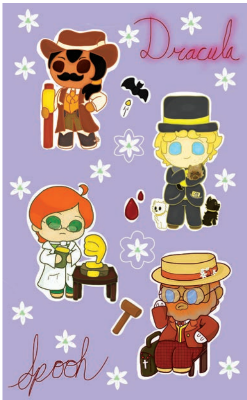
A sticker sheet featuring their interpretation of Dracula characters: (from top) Quincey P. Morris, Lord Arthur Holmwood, Dr. John "Jack" Seward and Professor Abraham van Helsing.