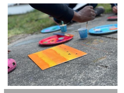
Orange and yellow artwork on the pavement.