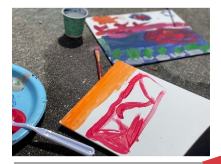
Two canvases on cement in front of the NSCC.