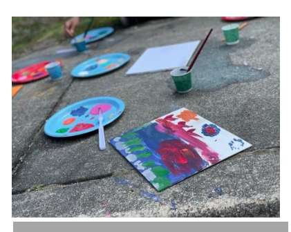
Plates and canvases on the sidewalk outside of the NSCC.