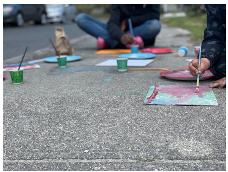
Figure 3: Participants of "Paint 'N' Inspire.'