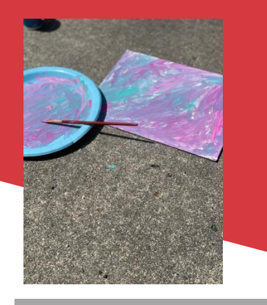
Plate, paint brush, and colorful canvas.