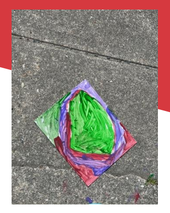
Canvas from "Paint 'N' Inspire."