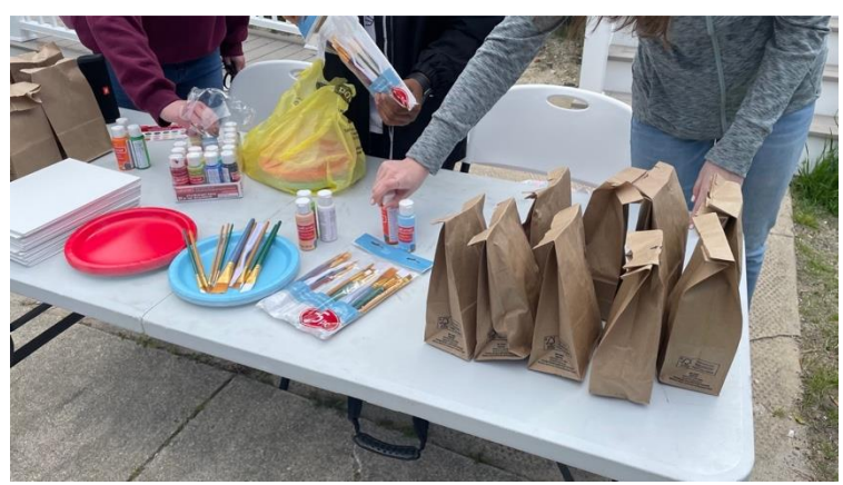
Figure 2: The event setup outside of the NSCC.

We applied for the NFO grant which fully sponsored this program. This proposal requested $723.00 from the Institute for Public Affairs and Civic Engagement at Salisbury University. The requested funds were used to support supplies and materials for the "Arts Drive" outside of the Newton Street Community Center in Salisbury, MD. The materials include 80 canvases, 25 acrylic paint, 100 paint brushes, 100 hand sanitizer bottles, 100 face masks, 80 thermometers and 250 paper packages. Each of these resources was imperative to the successful execution of the proposed project. The budget for each item was carefully considered on account of the estimated engagement for the event. On event day, we had ~20-30 attendees. Although all the supplies were not used, we donated the leftover materials to the community center for future events. Overall, the event produced a great turnout, with children being fully engaged in their paintings. Some participants requested additional canvases to fully display their artistic abilities.