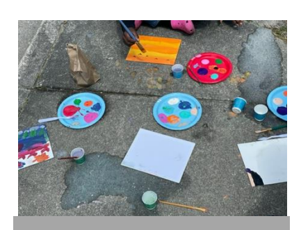
Plates, paints, and canvases.