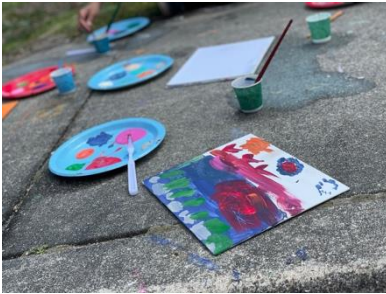
Plates and canvases on the sidewalk outside of the NSCC.