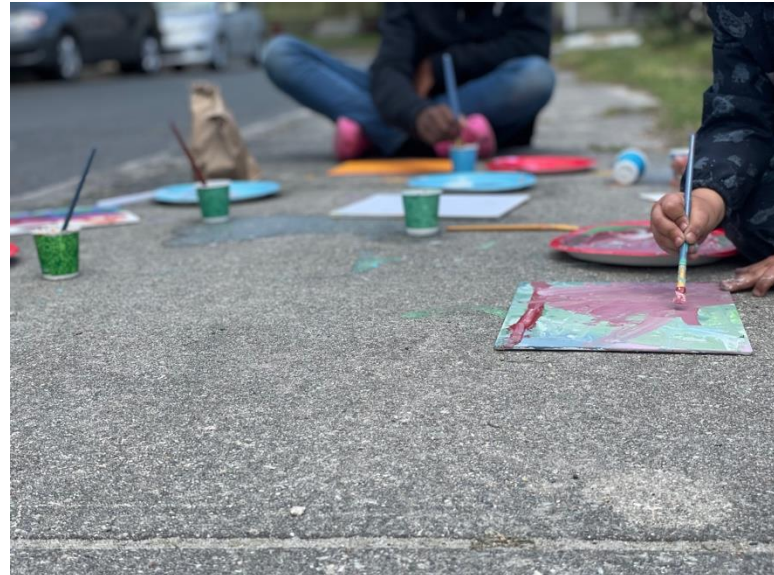
Figure 3: Participants of "Paint 'N' Inspire."