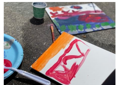
Two canvases on cement in front of the NSCC.