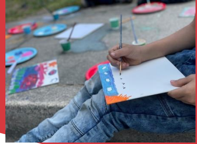
Event participant painting artwork on canvas.