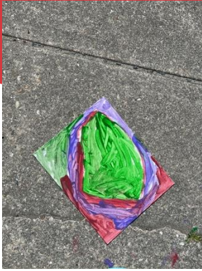
Canvas from "Paint 'N' Inspire."