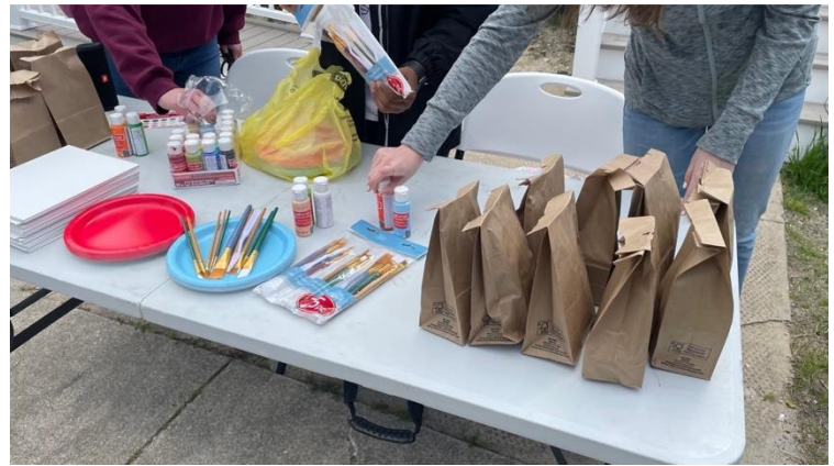
Figure 2: The event setup outside of the NSCC.

We applied for the NFO grant which fully sponsored this program. This proposal requested $723.00 from the Institute for Public Affairs and Civic Engagement at Salisbury University. The requested funds were used to support supplies and materials for the “Arts Drive” outside of the Newton Street Community Center in Salisbury, MD. The materials include 80 canvases, 25 acrylic paint, 100 paint brushes, 100 hand sanitizer bottles, 100 face masks, 80 thermometers and 250 paper packages. Each of these resources was imperative to the successful execution of the proposed project. The budget for each item was carefully considered on account of the estimated engagement for the event. On event day, we had ~20-30 attendees. Although all the supplies were not used, we donated the leftover materials to the community center for future events. Overall, the event produced a great turnout, with children being fully engaged in their paintings. Some participants requested additional canvases to fully display their artistic abilities.