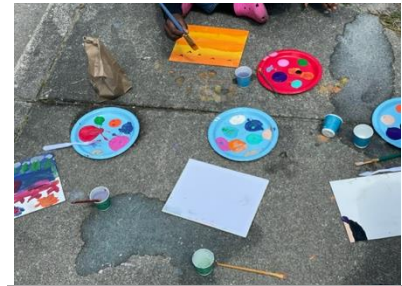
Plates, paints, and canvases.