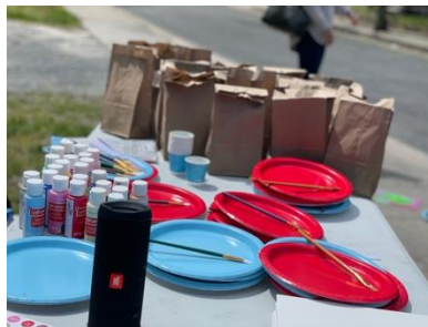
Table set-up outside of the NSCC.