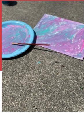
Plate, paint brush, and colorful canvas.