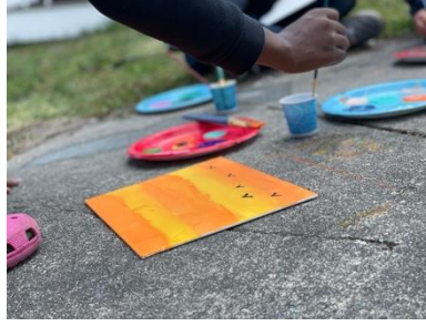
Orange and yellow artwork on the pavement.