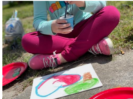
Event participant working on artwork.