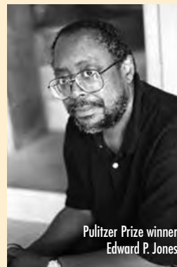
Pulitzer Prize winner Edward P. Jones