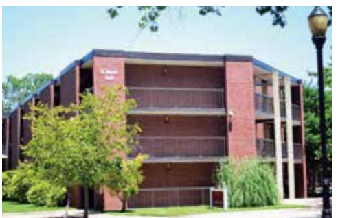
ST. MARTIN HALL